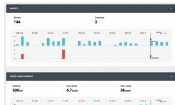
View each driver's performance in real time.