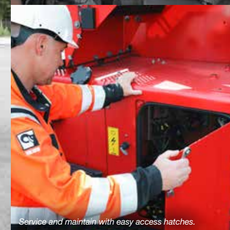
Service and maintain with easy access hatches.