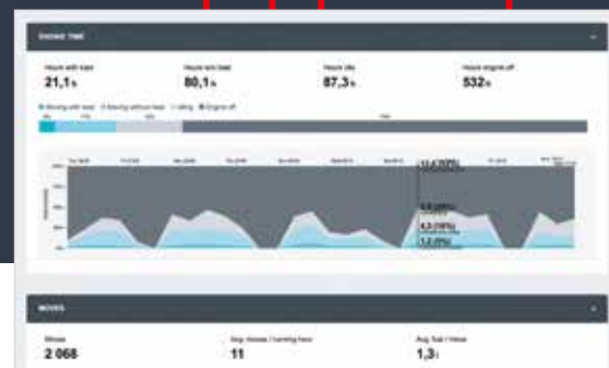
View each machine's movements as they occur.