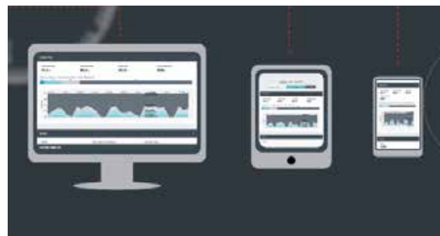
Access on mobile, tablet or traditional screen.

Kalmar Insight* comes fitted in all new Kalmar machines and can be retrofitted to existing Kalmar machines or those built by other manufacturers.