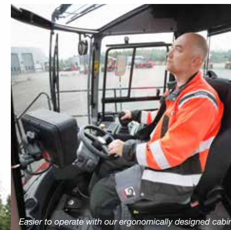
Easier to operate with our ergonomically designed cabin.

With easily accessible service points, engine hatches instead of a hood, and extended service intervals, your new top loader will be easier and quicker to maintain, saving you time and money.